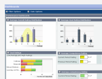
Reports / Dashboards

One-click Reports & Dashboards help your organization monitor progress against business goals and identify and address critical skill and competency gaps.